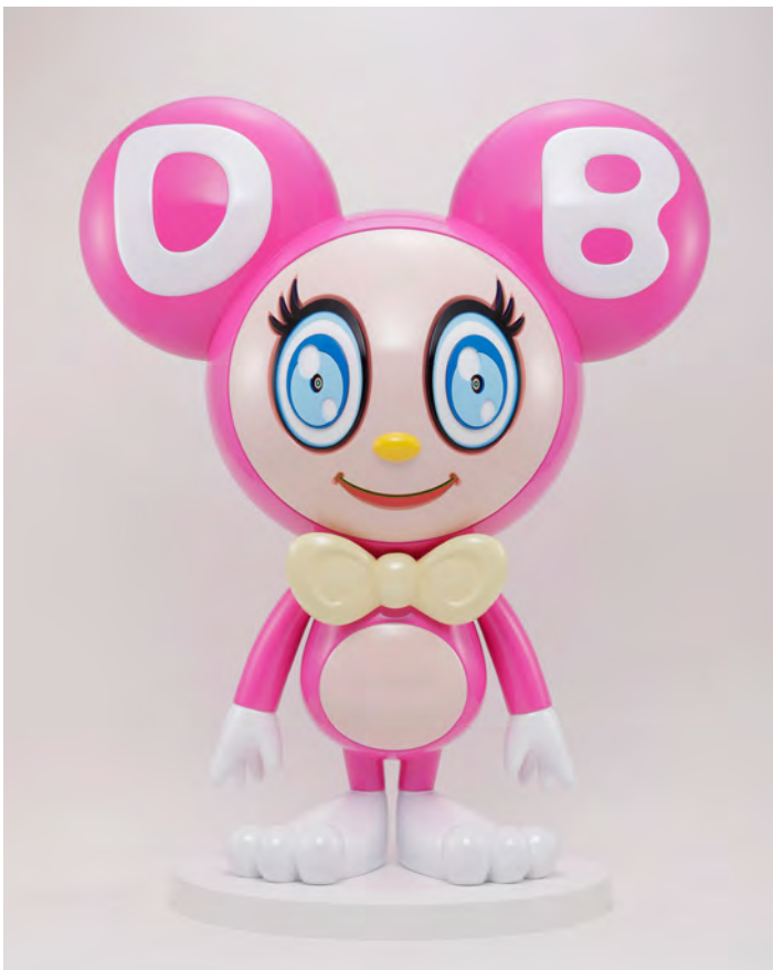
DOB (pink). FRP, urethane paint, stainless steel, wood, 87,1 × 68,8 × 47 cm (including pedestal). 20 Editions + 2 AP + 2 SP AP1 or SP1.

The exhibition opens with a series of sculptures and paintings dedicated to Mr. DOB , the artist's iconic character created in 1993. Mr. DOB's design was inspired by several animated figures such as Doraemon, Sonic and Mickey Mouse. His name is a diminutive of the expression "doboite" meaning "why" in Japanese slang. Mr. DOB has undergone many transformations over the years, but is still recognizable by the letters of his name on his face and ears. Accompanying Takashi Murakami in his existential questioning, the DOB character has developed a complex psychology, to the point of becoming the artist's avatar.