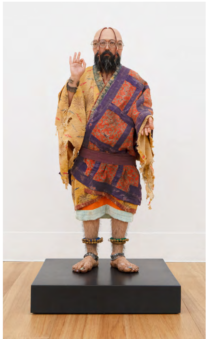
Untitled, 2017. Silicon, FRP, 70 x 35 x 35 cm. 1/5 Editions + 2 AP. ©2017 Takashi Murakami/Kaikai Kiki Co., Ltd. All Rights Reserved. Courtesy Perrotin.

Lastly, the robot sculpture Arhat completes this exhibition. This ironic self-portrait refers to the theme of the Arhats –the clairvoyant disciples of Buddha– that Murakami has been exploring for the past ten years with the monumental painting The 500 Arhats created for his retrospective in Qatar in 2012.