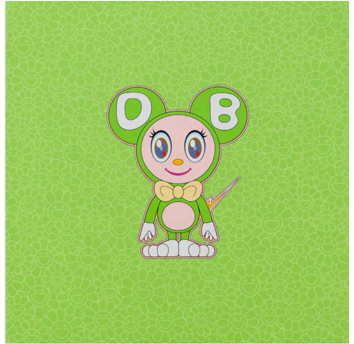
Untitled, 2020. Acrylic on canvas mounted on aluminium frame, 100 x 100 cm. ©2020 Takashi Murakami/Kaikai Kiki Co., Ltd. All Rights Reserved. Courtesy Perrotin.

Also on view: new paintings from the body of work Murakami.Flowers . A component of NFT project Murakami.Flowers, the pixelated flower paintings by Takashi Murakami combine the artist's iconic Superflat aesthetic with the nostalgia of the graphics of 1970's Japanese games. The series was conceived around the key number 108 associated with the Buddhist principle of bonnō , or earthly temptations; 108 backgrounds, 108 flower colors, 108 fields. As the artist states, "The existence of Murakami.Flowers extends beyond blockchain." Each flower of this series is unique, crafted by hand and required thousands of hours of work. Through the adaptation of an NFT into the real world, the artist bridges the physical and digital realms in order to trigger a cognitive revolution.