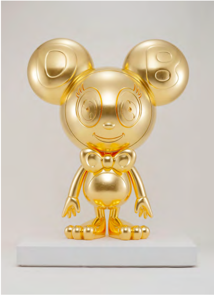
DOB (Gold), 2019 - 2020. Gold leaf on FRP, 158,4 × 130,4 × 82,8 cm. ©2019 - 2020 Takashi Murakami/Kaikai Kiki Co., Ltd. All Rights Reserved.