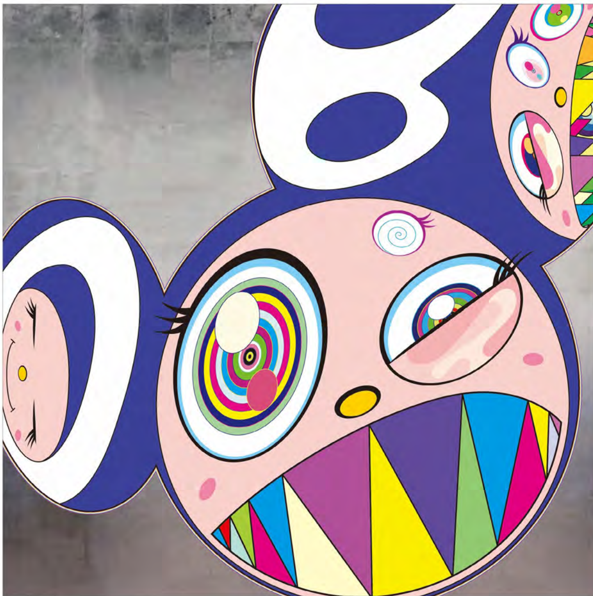
Untitled, 2022. Acrylic on canvas, 100 × 100 cm. ©2022 Takashi Murakami/Kaikai Kiki Co., Ltd. All Rights Reserved. Courtesy Perrotin.