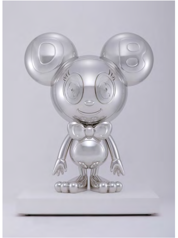
Mr. DOB (Platinum), 2019 - 2022. Platinum leaf on FRP, 173,4 x 130,4 x 130 cm (including pedestal). ©2019 - 2022 Takashi Murakami/Kaikai Kiki Co., Ltd. All Rights Reserved.